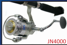
Graphite body 8+1 Ball Bearings Aluminium Spool