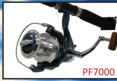
Graphite body 9+1 Ball Bearings Aluminium Spool