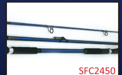
3.9 mtr 80% Carbon, 3 piece Surf Rod 100-200gm Class