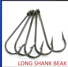
LONG SHANK BEAK