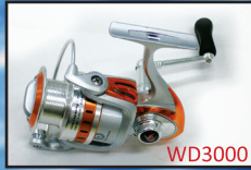
Japanese Remy Body 8+1 Ball Bearings Aluminium Spool Available in 4000 Series