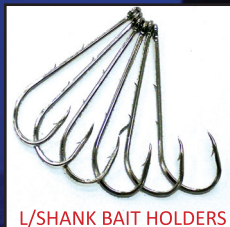
L/SHANK BAIT HOLDERS