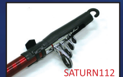
2.4mtr 100% Carbon, Telescopic Rod 30-60gm