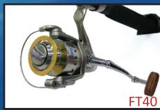
Graphite body 8+1 Ball Bearings Aluminium Spool