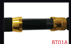
1.8 mtr 100% Solid Glass, 1 piece, S/S Rollers 15-25kg Class