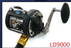
1 Piece Graphite body 8 Ball Bearings Aluminium Spool Instant Drag System