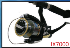
Graphite body 5+1 Ball Bearings Aluminium Spool Available in 6000 Series